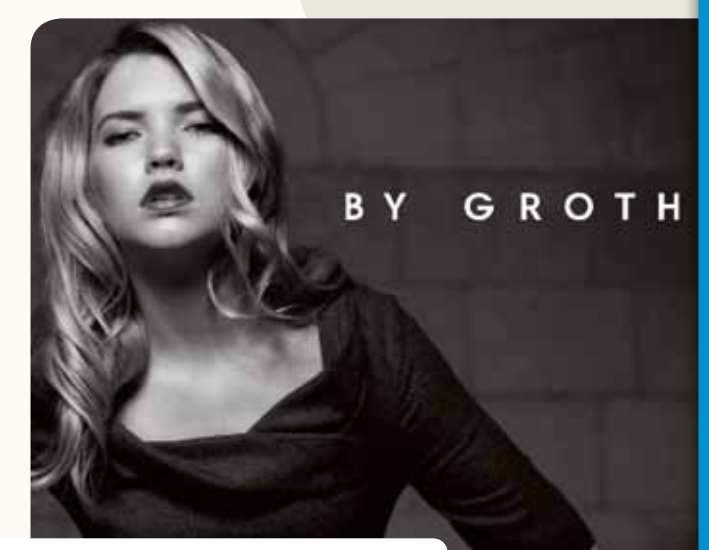
Danish cool – modeling the By Groth AW10 collection

http://ec.europa.eu/regional_policy/funds/recovery/