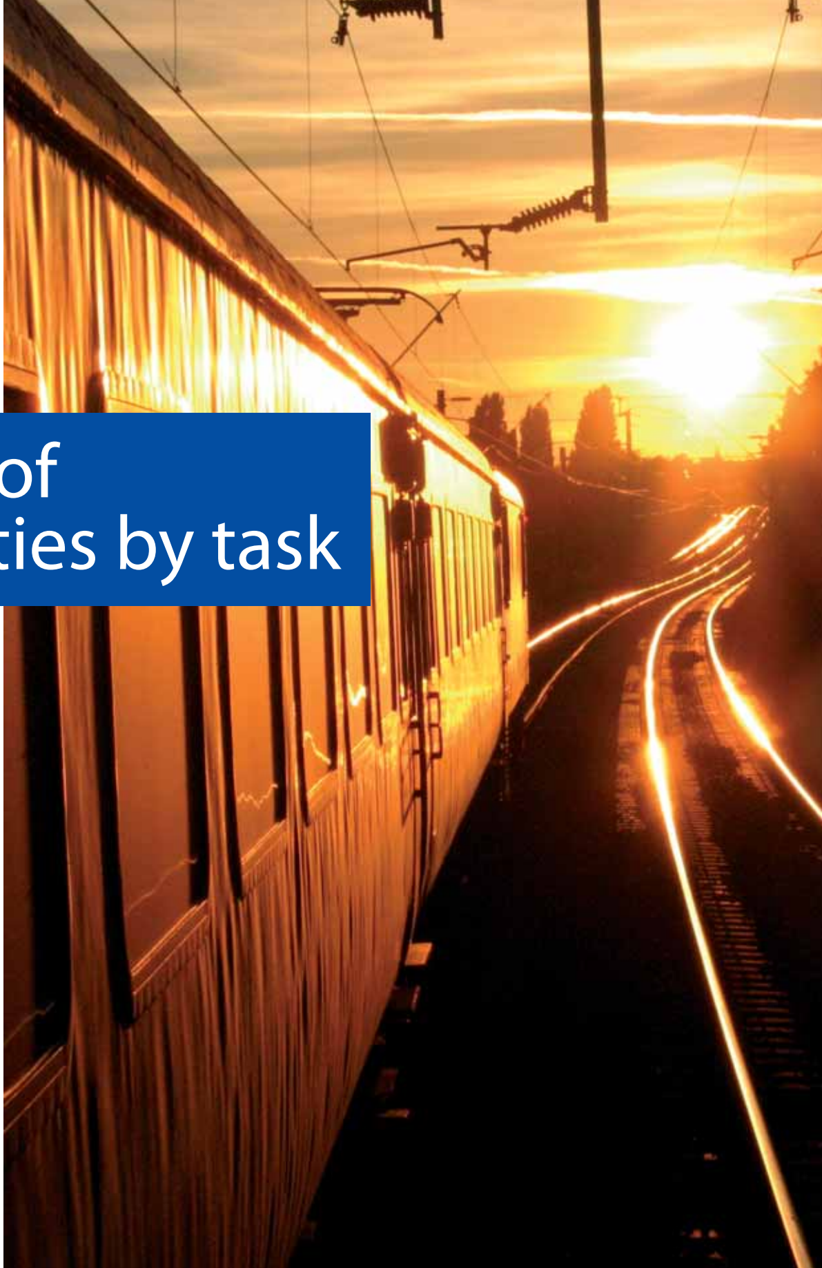
Table of Activities by task